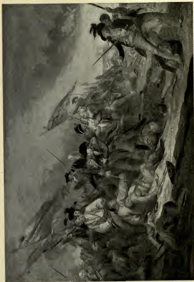
The battle of Bunker Hill.